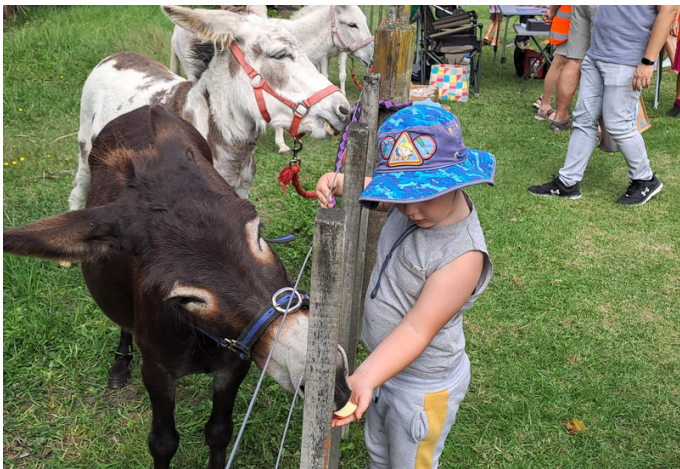
Feeding the donkeys.