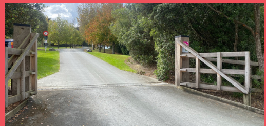
The main driveway and top car park will be closed.