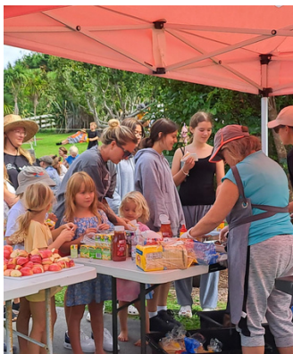
Free sausage sizzles.