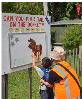
Pin the tail on the donkey.