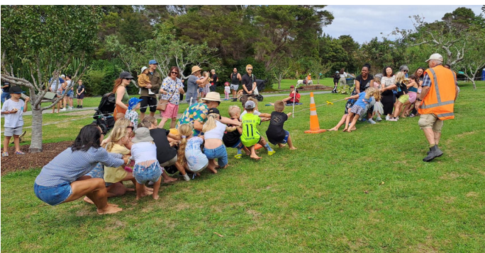
Tug of war.