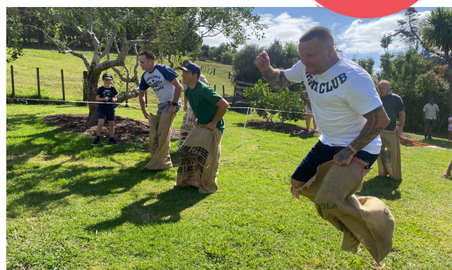
The Dad's sack race.