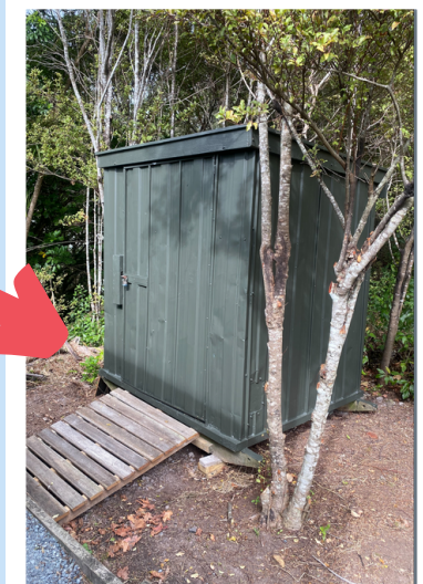
Before (left) and after (right).