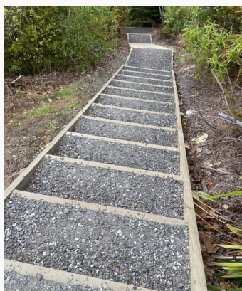
Out with the old.. in with the new. Boardwalks and stairs were all replaced in the process.