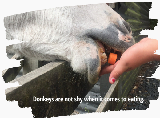
Donkeys are not shy when it comes to eating.

Donkeys aren't shy about letting you know when it's mealtime. Some are more vocal than others, but most will bray to signal their hunger.