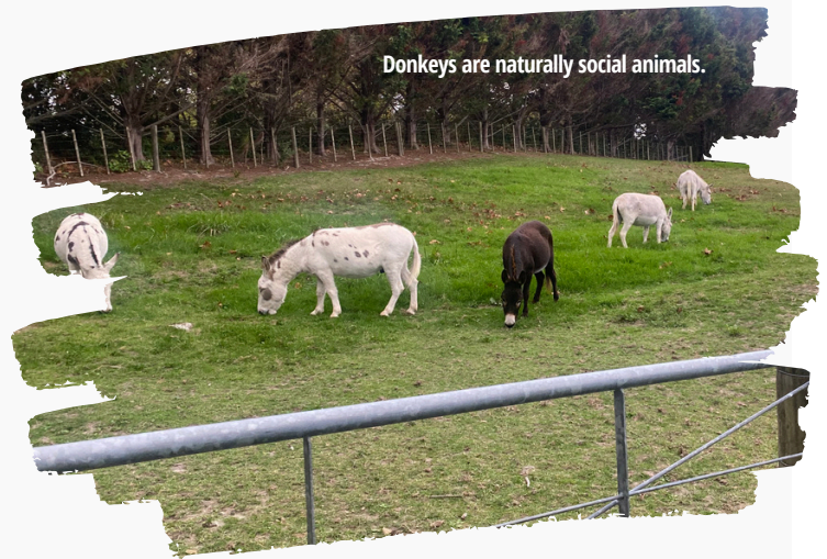
Donkeys are naturally social animals.

Donkeys are naturally social animals. While they bond best with other donkeys, companionship from horses, goats, or other livestock can also help. When left alone, a lonely donkey may bray loudly in search of a friend. For this reason, it's always best to keep donkeys in pairs or groups whenever possible.