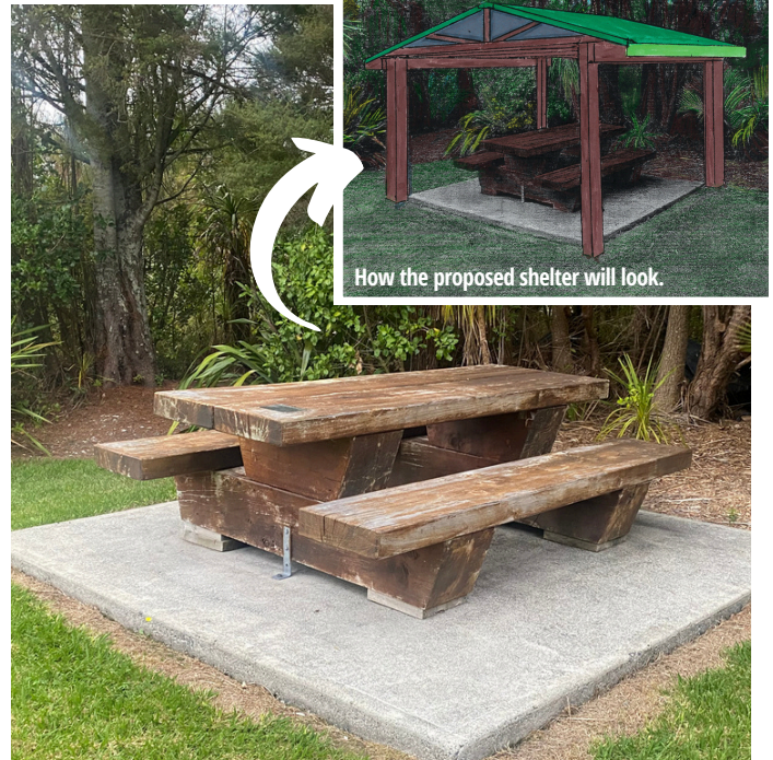
The picnic table is situated near the entrance to the Lily Pond Track.

Dave Whyman, owner of Four Square, Snells Beach has also confirmed they intend to collect donations at the till and display a fundraising "thermometer" to track progress towards our goal. He has also committed to matching donations dollar for dollar.